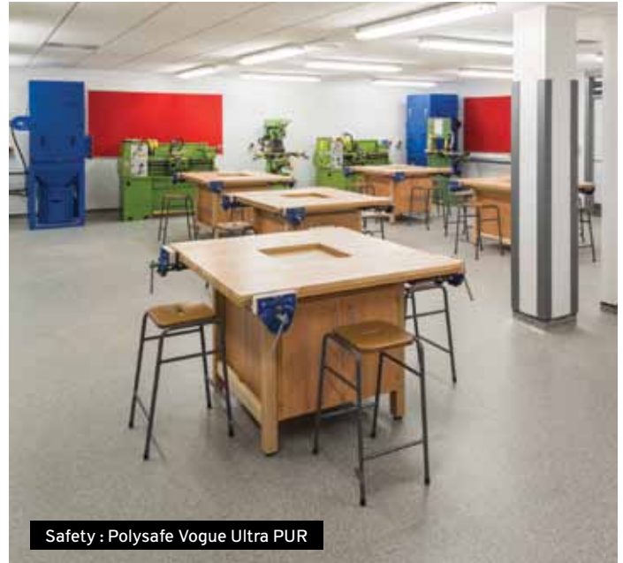
Safety : Polysafe Vogue Ultra PUR