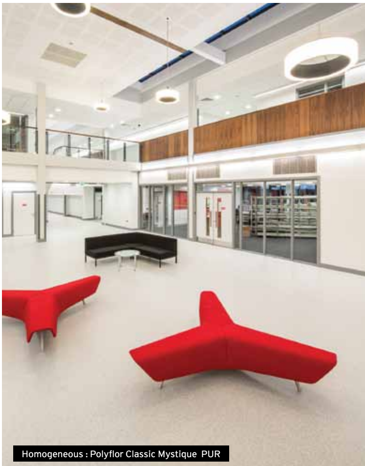
Homogeneous : Polyflor Classic Mystique PUR