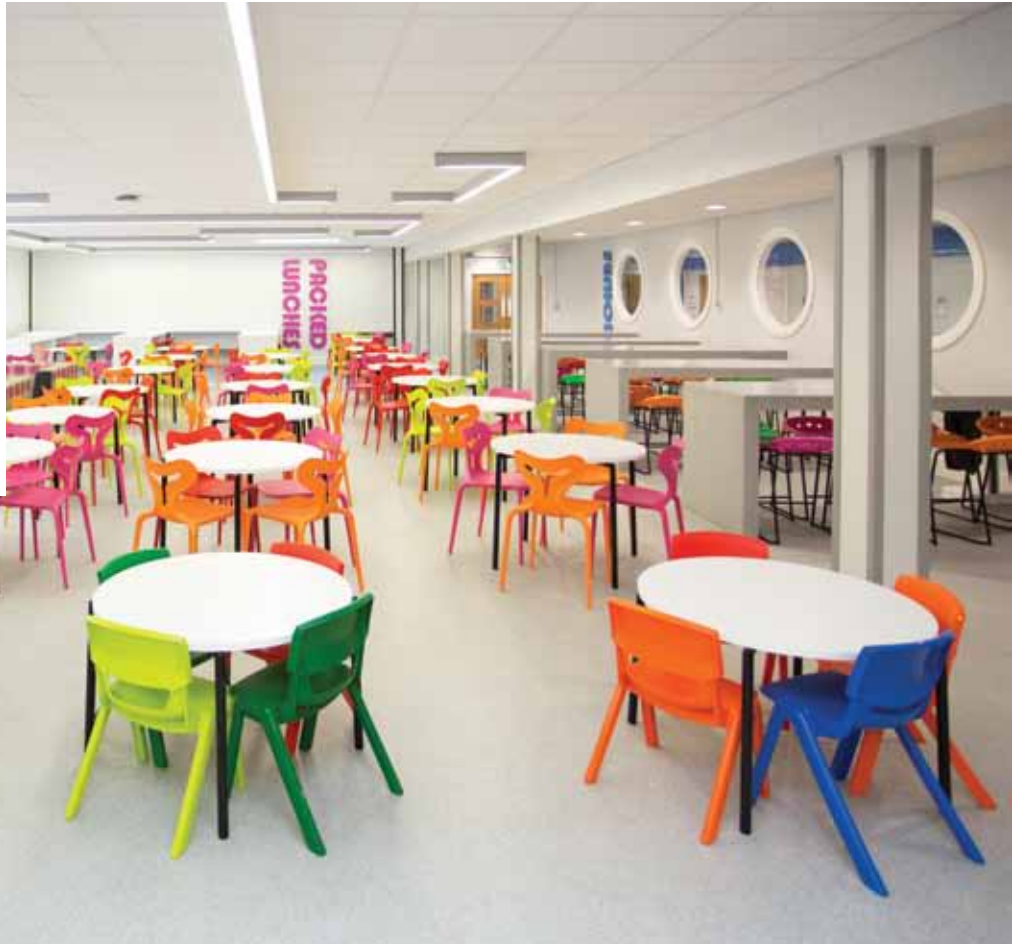
Safety : Polysafe Vogue Ultra PUR