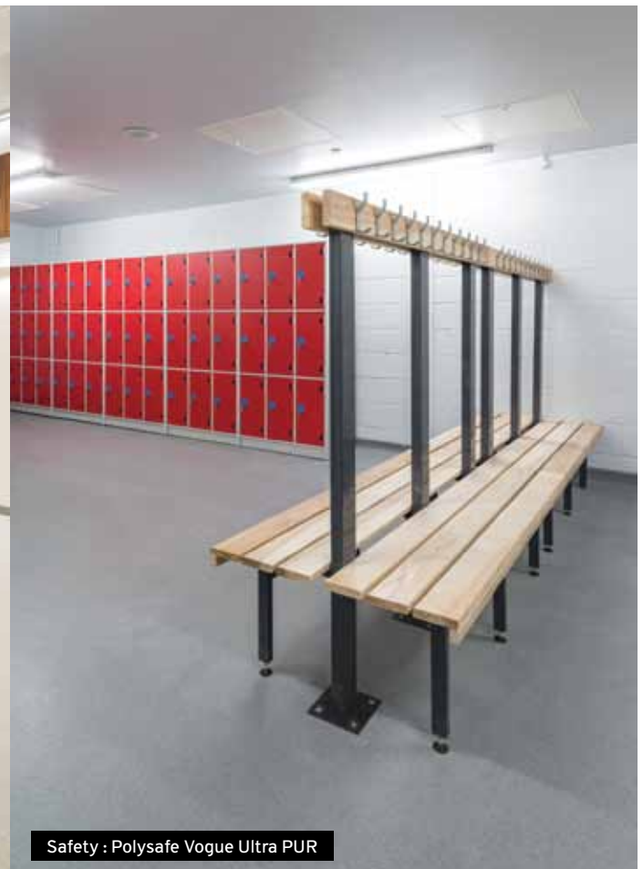
Safety : Polysafe Vogue Ultra PUR