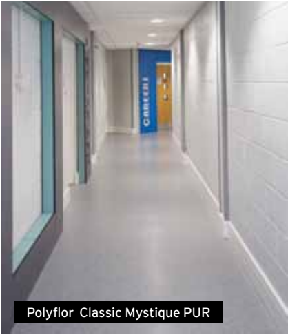
Polyflor Classic Mystique PUR

In 2012, 450 tonnes of waste vinyl flooring were collected and recycled, representing almost 150,000m 2 - that's enough to cover 21 football pitches.